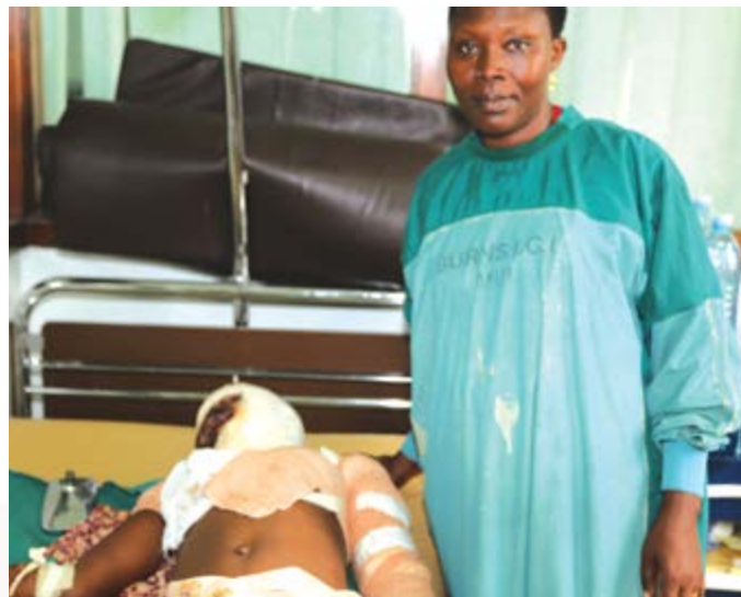
Caring Hands Medical social worker, assessing a patient with burns, in ICU burns unit Mulago hospital.

Helping vulnerable people has always been my passion, and I should say that it's a privilege to be part of CHF, which has made my dream come true by allowing me to make a difference in the lives of needy loved ones.