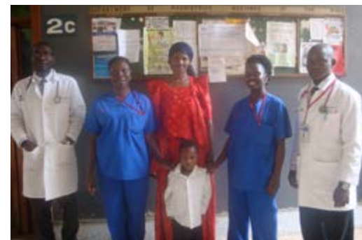
CHF medical team with a patient and a mother in Mulago

My duties as the medical doctor in CHF include daily rounds and reviews of the patients, identifying and advocating for their needs, and providing a holistic care and management of all admitted patients. As a doctor, I also represent the medical arm of CHF if called upon.