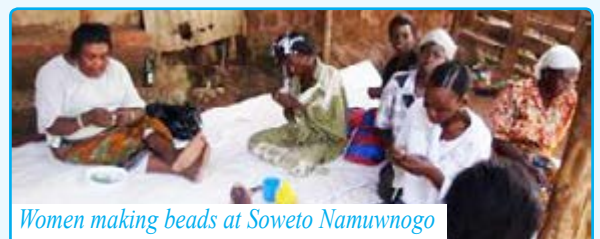
Women making beads at Soweto Namuwongo

support offered to these ladies has restored their hope and the reason for living. Our big thank you goes to everybody that supports us buying our crafts and products. You will always be in our prayers. We may not know you individually but God knows.