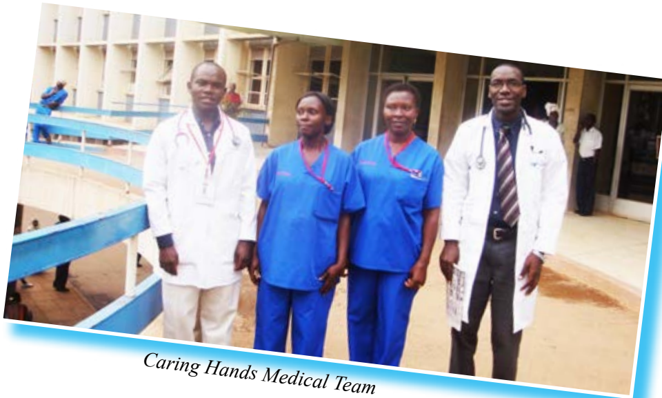
Caring Hands Medical Team

CHF is a great organization that I am proud to be part of. Working as the medical doctor among a very dedicated and committed medical team has been my greatest achievement and empowerment, and I hope this relationship with Caring Hands Foundation continues indefinitely. Being part of the Caring Hands team is an opportunity that any medical professional would wish for, and I am blessed to be a part of it.