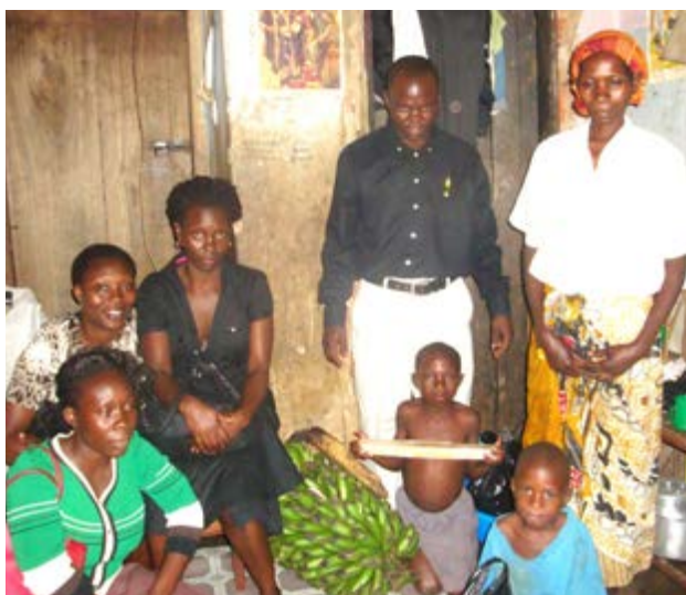
CHF team at a home visit

My duties as the medical doctor in CHF include daily rounds and reviews of the patients, identifying and advocating for their needs, and providing a holistic care and management of all admitted patients. As a doctor, I also represent the medical arm of CHF if called upon.