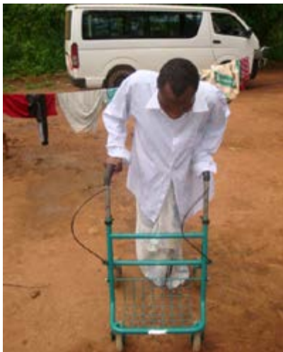
Re-uniting a patient with his family. Behind is a van that brought the CHF Social Worker to the patient's family.