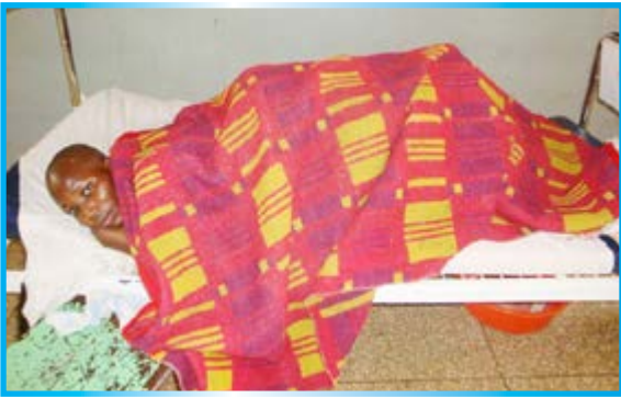
Boda boda cyclist survivor lying on hospital bed